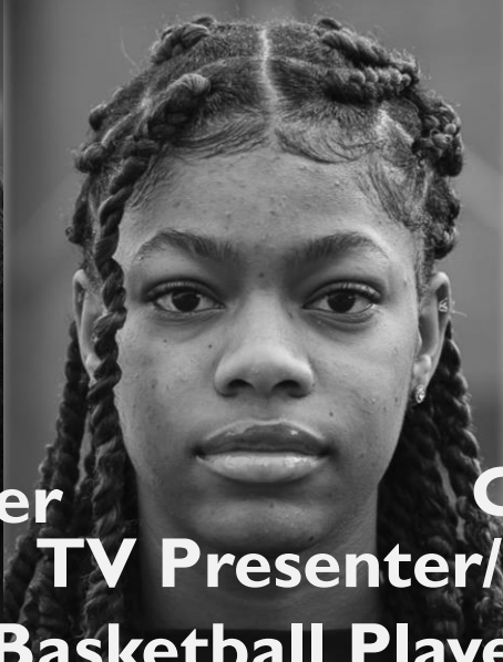
TV Presenter/ Basketball Player