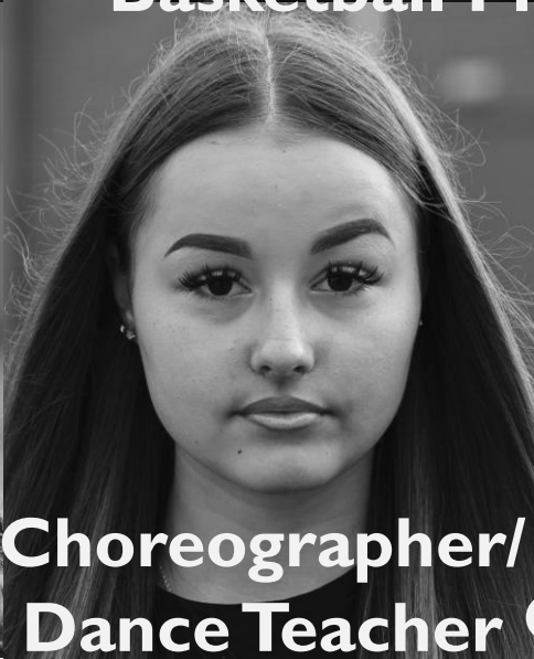
Choreographer/ Dance Teacher