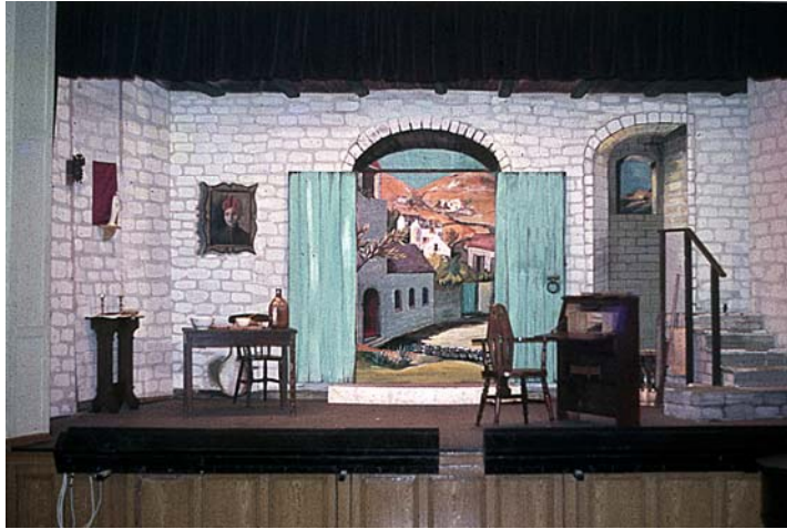
School play1962: To live in peace