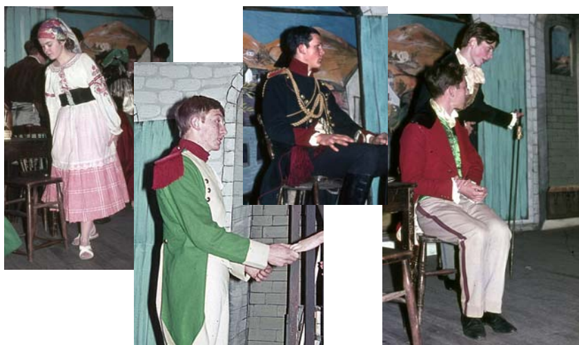
School play1962: To live in peace